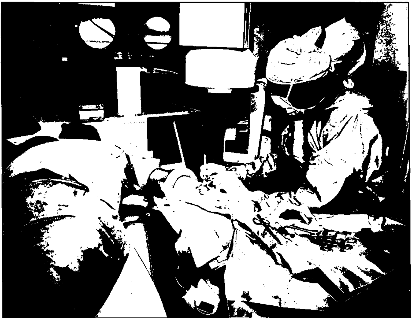
Surgeon Removes Implant.