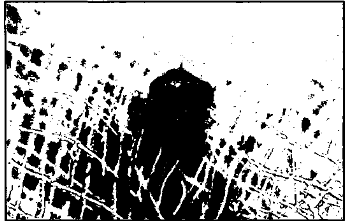
Object on a surgical sponge.