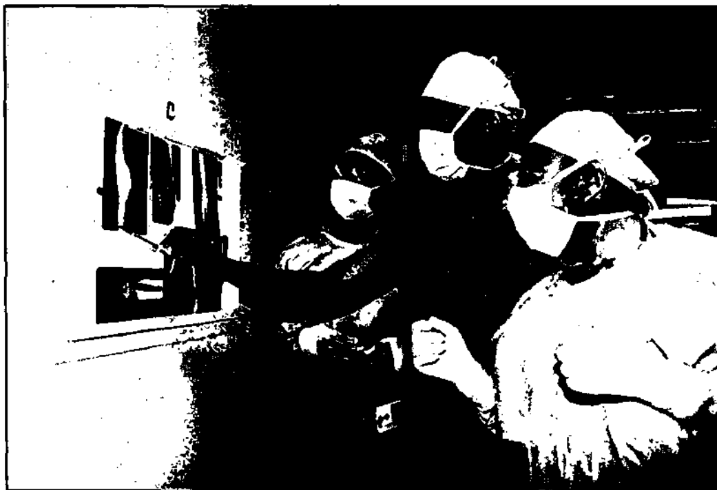
Surgeons review x-rays.

These are all covered with a very strange tough dark gray membrane that rejects opening with a surgical blade until the objects have been dried for 24 hours. Analysis of the membrane shows that it is composed of the body's own tissues and contains only three major factors: a pro-